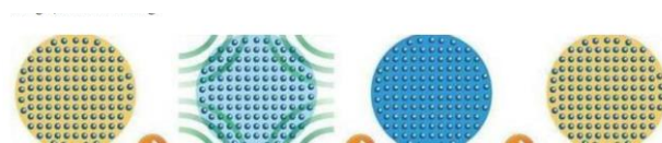
IQF Frozen Process with Liquid Nitrogen