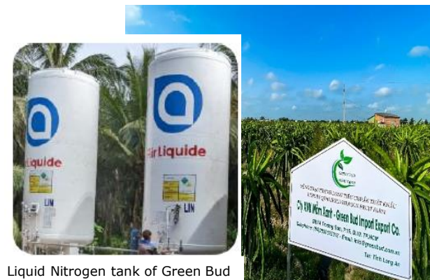
Liquid Nitrogen tank of Green Bud